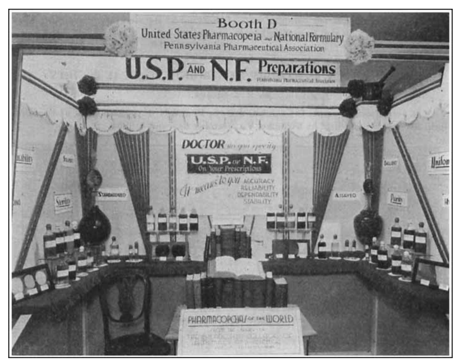
The Pennsylvania U. S. P. and N. F. Exhibit.

The display was attractively decorated in blue and white; a mortar and pestle that was over 100 years old was set high in one corner of the display; a beautiful show globe holding three different colored liquids was placed in each corner of the display. Twenty-eight official